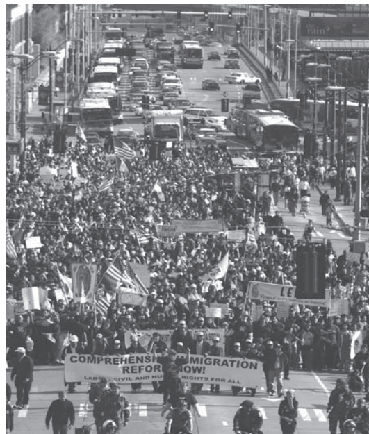
Used with permission.

Economic concerns have long dominated discussions about immigration. For most of the past century, business leaders and big farmers have generally favored open immigration to ensure an adequate supply of workers. In the early 1900s, the steady flow of unskilled immigrants into the labor force helped fuel the boom in manufacturing. Although opportunities for unskilled factory workers have declined since World War II, other businesses, such as hotels, restaurants, and agriculture continue to depend on low-wage labor to hold down costs.